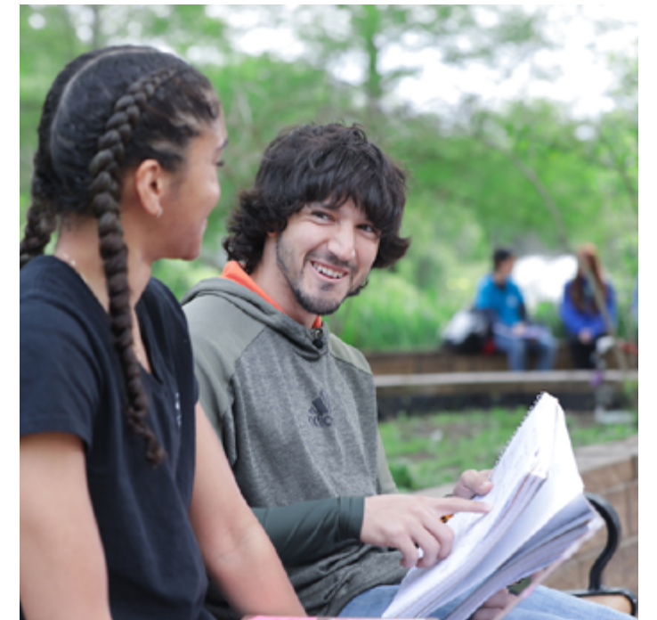
UHCL students discussing notes at the Pat and Wendell Wilson Park

More information at Strategic Impact 2025 and Beyond .