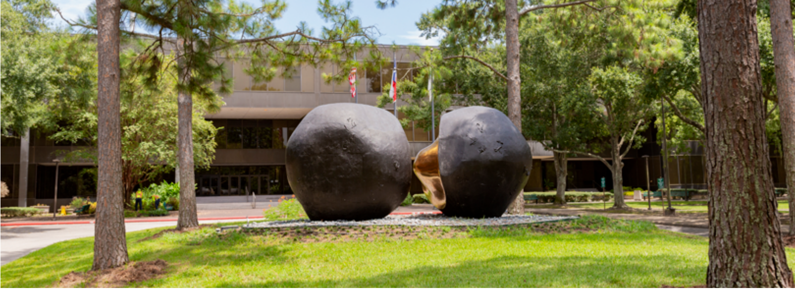
“Spiritus Mundi,” one of UHCL’s iconic sculptures