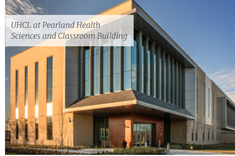
UHCL at Pearland Health Sciences and Classroom Building