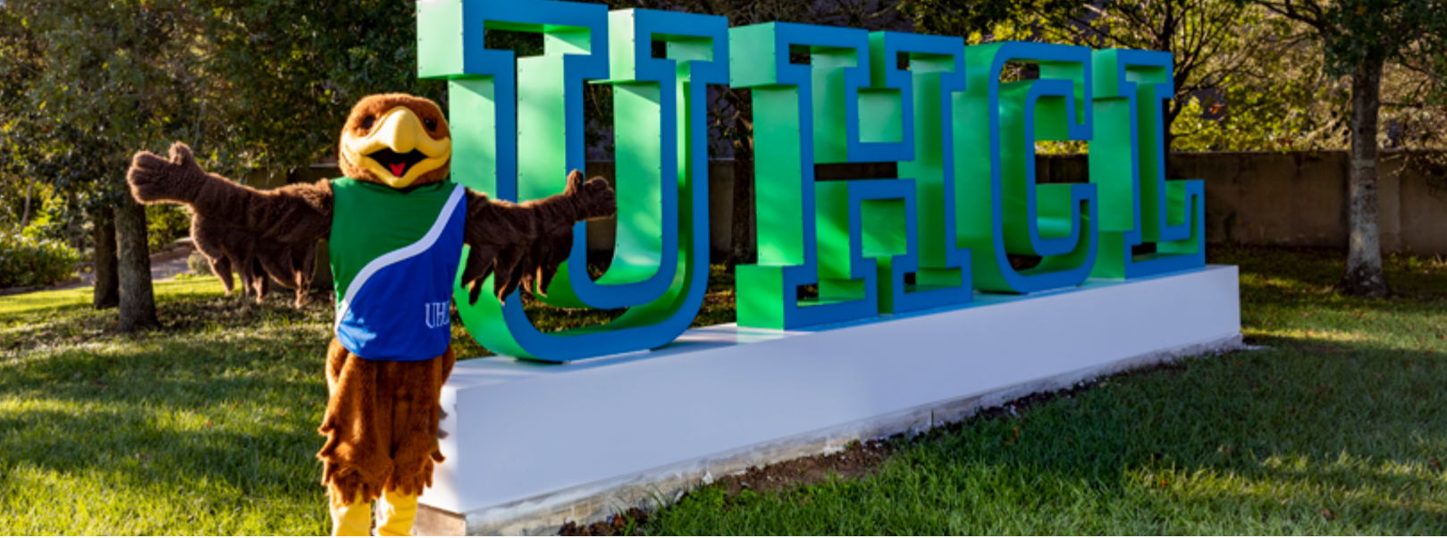
UHCL's Mascot, Hunter the Hawk, posing with our UHCL letters