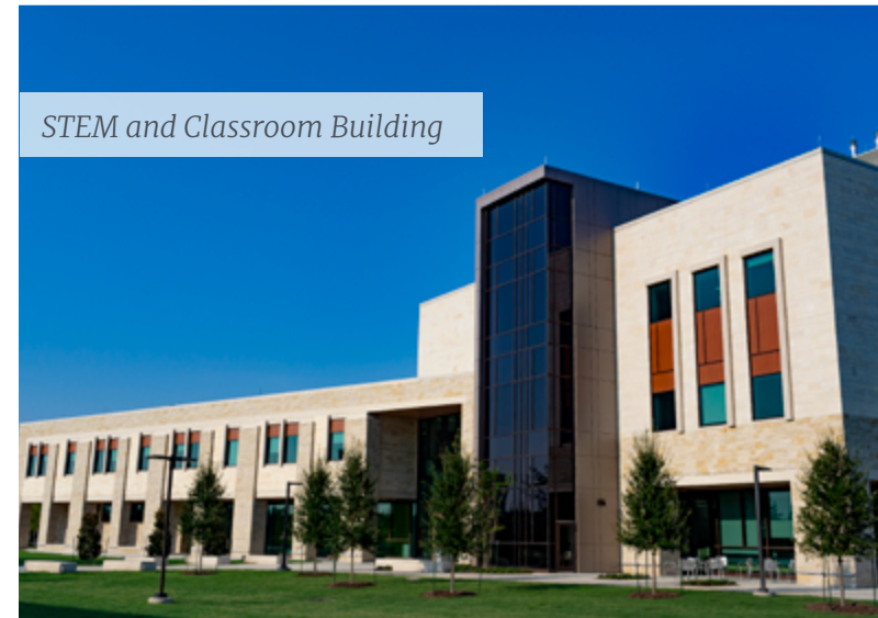
STEM and Classroom Building