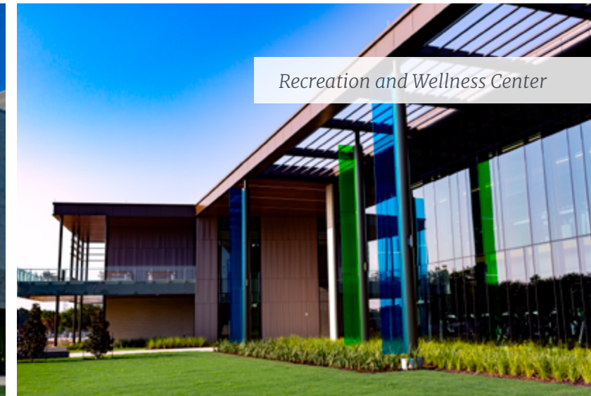
Recreation and Wellness Center